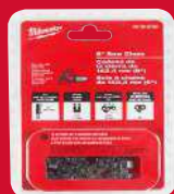
152MM (6") SAW CHAIN 49-16-2732