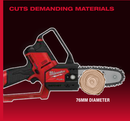
CUTS DEMANDING MATERIALS