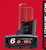
REDLITHIUM-ION BATTERY PACK