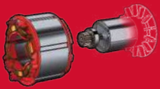
POWERSTATE™ BRUSHLESS MOTOR